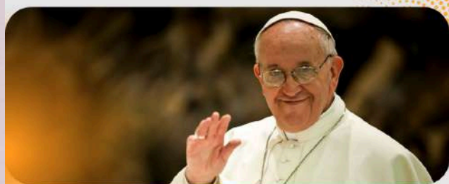
POPE FRANCIS on 58th World Day of Peace

"Hope overflows in generosity; it is free of calculation, makes no hidden demands, is unconcerned with gain, but aims at one thing alone: to raise up those who have fallen, to heal hearts that are broken and to set us free from every kind of bondage"